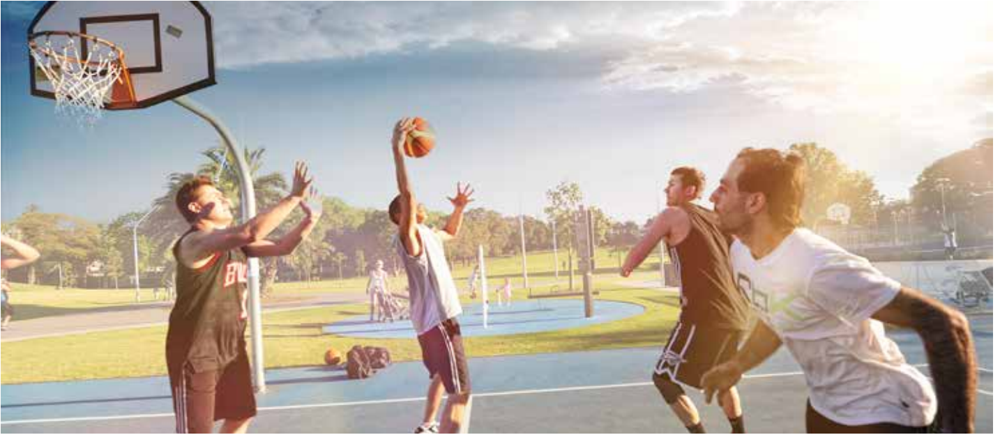
Prince Alfred Park offers 7.5 hectares of green space, basketball courts, tennis courts, fitness stations as well as benches to sit and relax, barbecue facilities and picnic areas