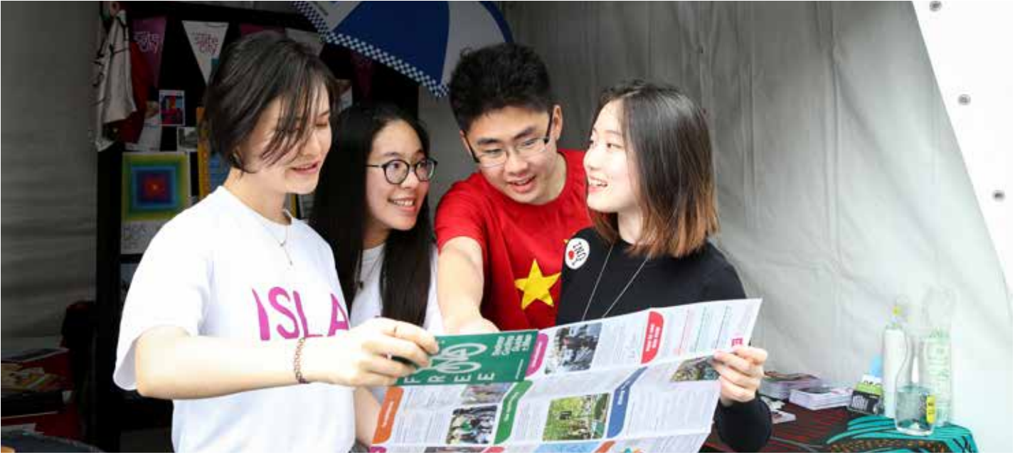
ISLA ambassadors hosting an information stall at an orientation event