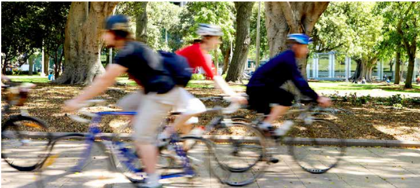
The City offers courses on cycling, bike care and maintenance at the Sydney Park Cycling Centre