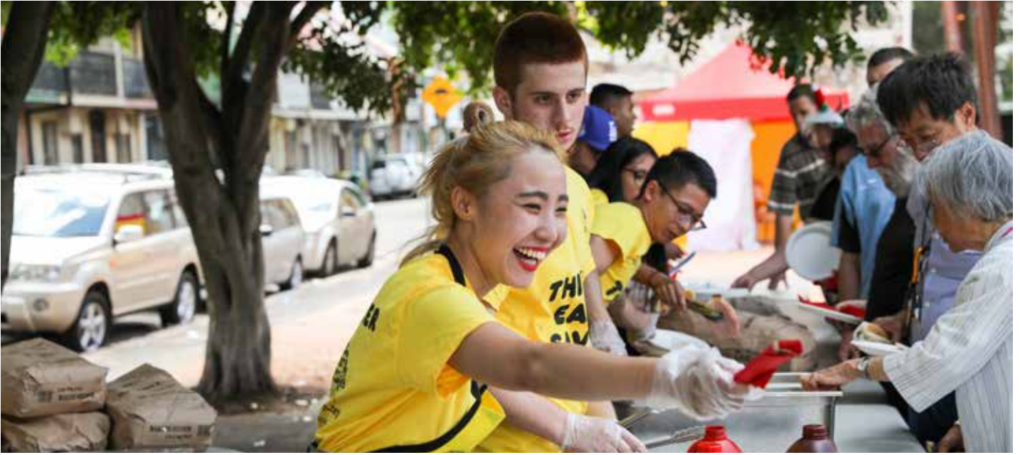
Volunteers helping at the Redfern Community Centre Christmas Party

Globally, the international student market is one of the fastest growing industries in the world, and national and international competition is intensifying. This means we can't be complacent, and we can't work alone. We need to partner with StudyNSW, the NSW Police Force, Redfern Legal Centre and Sydney's educational establishments to maintain our status as a premier education destination.