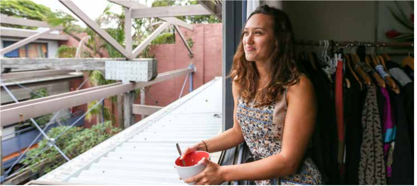
A cooperative housing complex in Newtown providing affordable housing for students