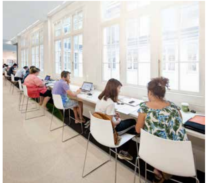
The library network offers access to a huge number of books, CDs and DVDs

Australia's education sector is so globalised that one in five students is from abroad 6 , with students from Asia making up more than two-thirds of their number. 7 In Sydney, most of our international students are from Asia, putting the city in a strong position to benefit from these growing economies. 8 In addition to benefiting employers who hire international students, the sector can help local businesses, workers and residents build productive social, cultural and business relationships in Asia.