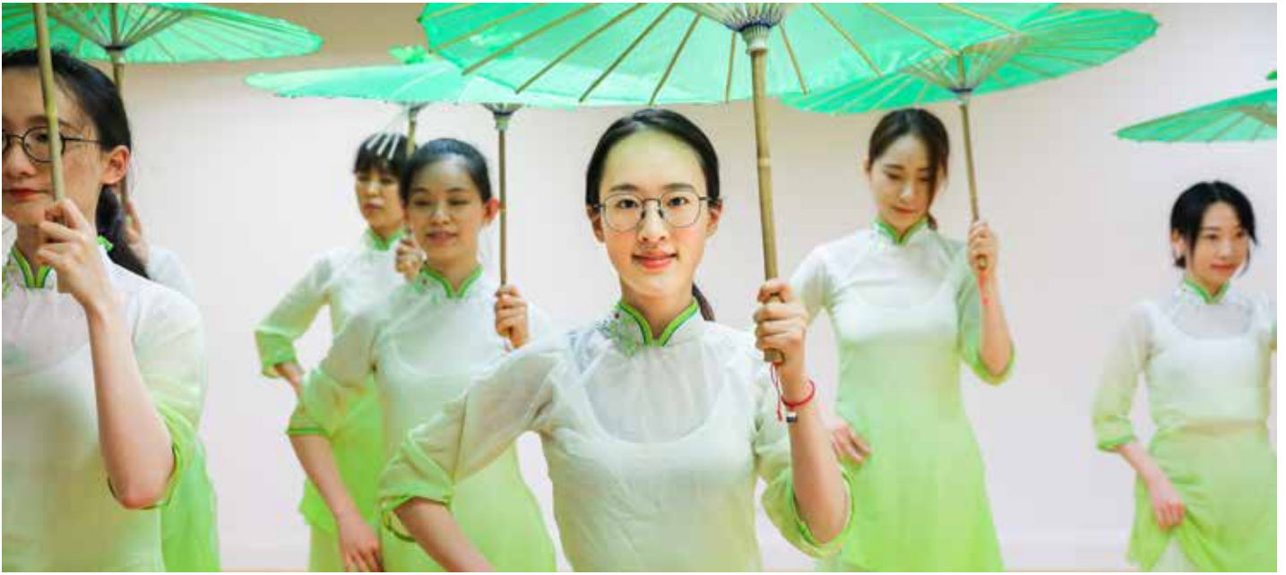
Chinese New Year 2018 festivities include events run by ISLA ambassadors for international students