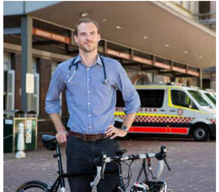
Cycling to work at Royal Prince Alfred Hospital