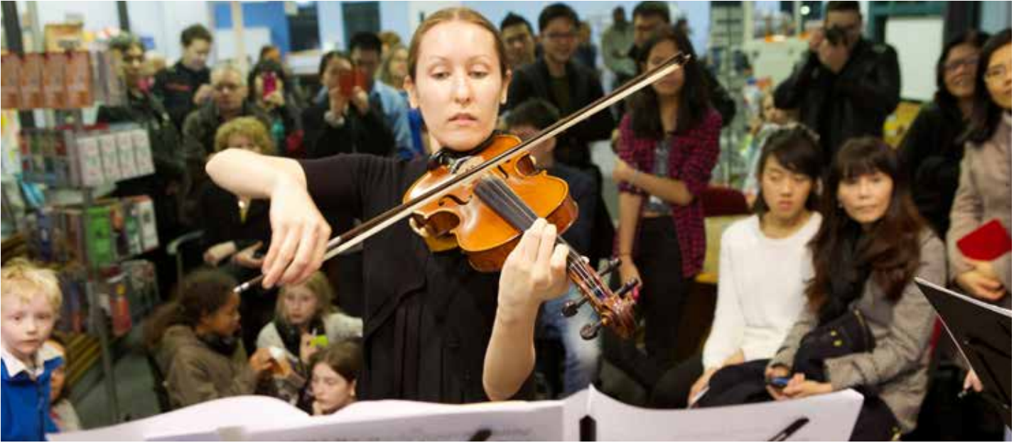
International students can attend community events, such as the one above held at Glebe Library featuring The Glebe Strings Ensemble