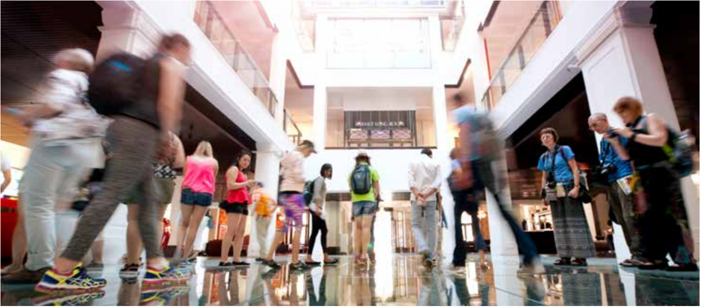
Our Customs House Library offers guided tours for international students to introduce them to general library services and English language learning resources