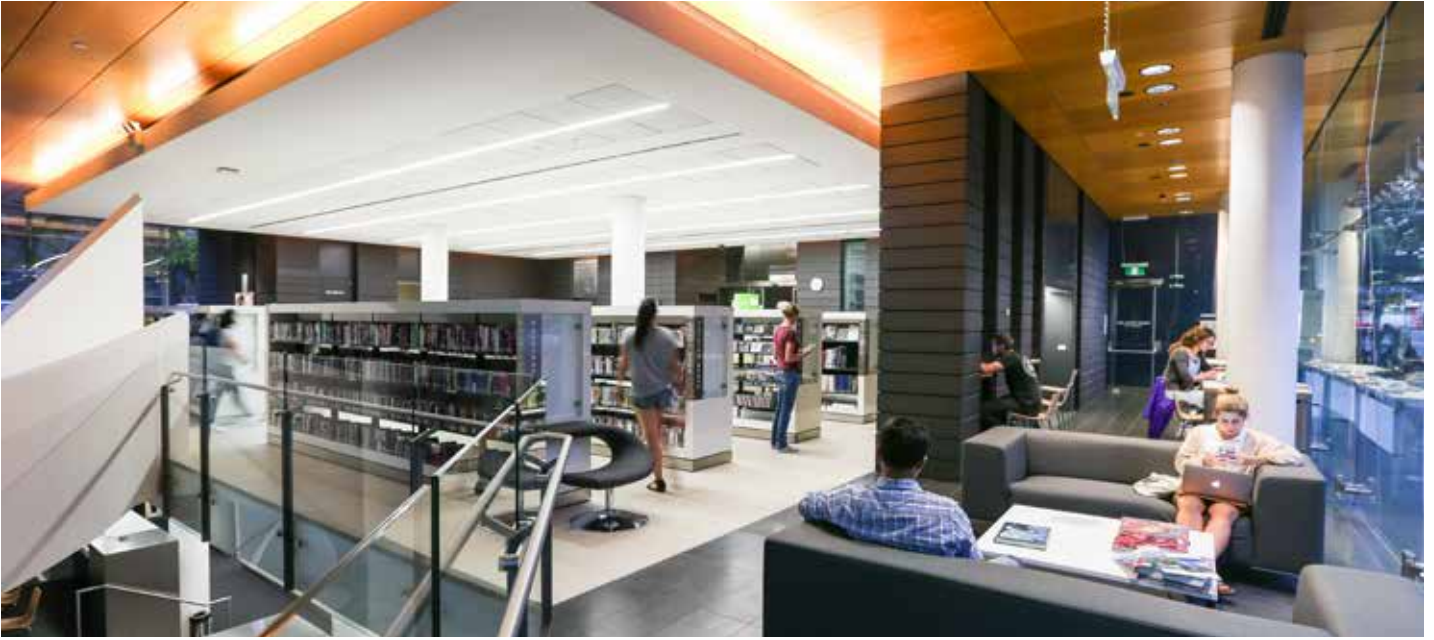
Our Surry Hills Library pictured above spans four floors and is open seven days a week. It also houses a community centre and childcare centre.

Our role is to work with industry and government partners to create an investment climate that allows the international education sector to grow and diversify. Through research and collaboration, three key themes were identified for how the City can best support the sector. They are welcoming, wellbeing and work-integrated learning. International students' study experiences – specifically, what happens outside the classroom – are key to enabling Sydney to stand out as a globally favoured education destination, and the City is uniquely placed to support these experiences.