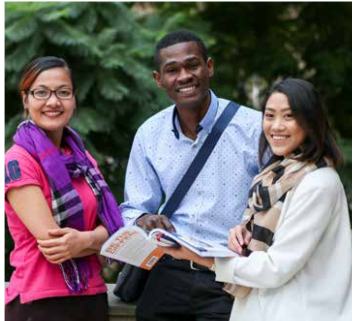
ISLA ambassadors enjoying a book

In 2015, international students contributed $18.8 billion to the Australian economy, a 10.4 per cent increase on 2014 2 , making the sector the largest service-based export industry in Australia. Overall, it is the country's third-largest export earner. 3