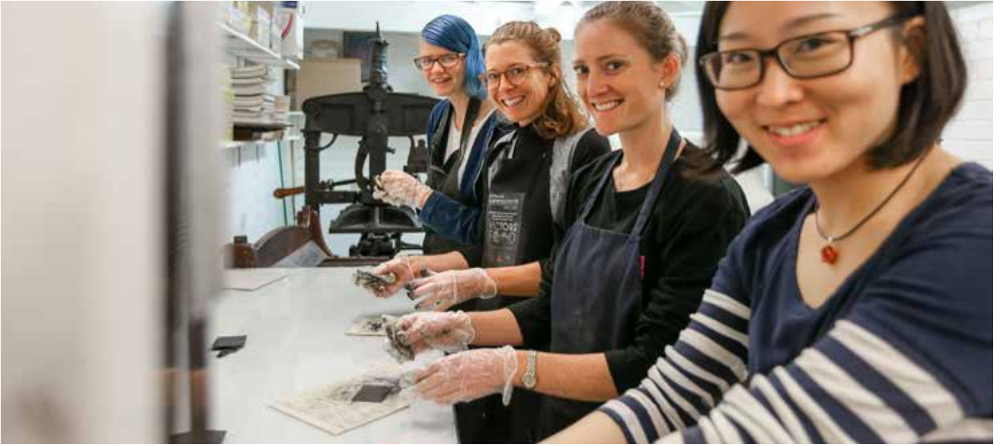
Group enjoying a workshop at Pine Street Creative Community Arts Centre