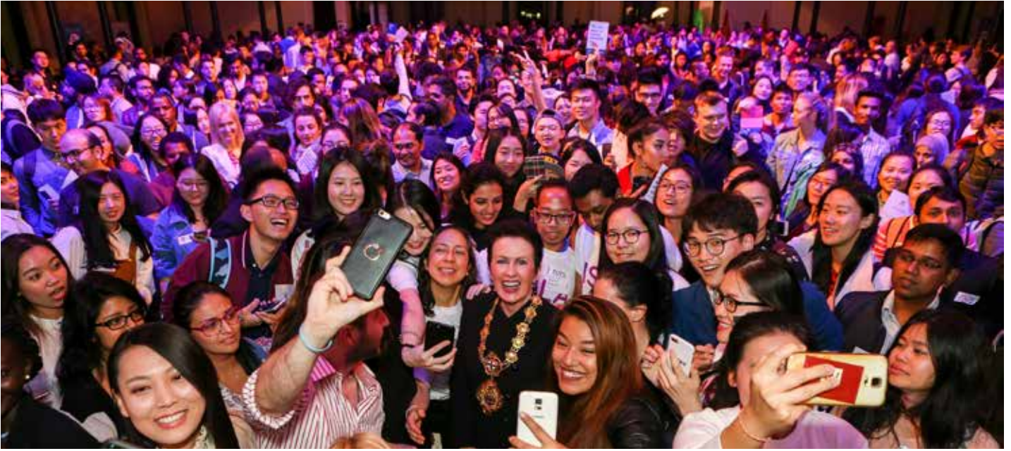
Official Welcome to Sydney for international students at Sydney Town Hall