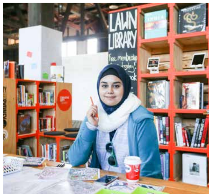
Lawn Library activation at the Sydney Writers Festival held at Walsh Bay

This will support the structural adjustment of the economy towards the valuable knowledge sector, which can help secure the living standards of Sydney residents well into the 21st century.