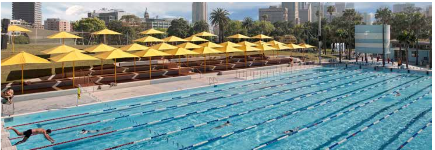
Prince Alfred Park pool is open year round is the City's first heated outdoor pool that is fully accessible. Adult learn to swim classes are available at pools in our local area.

At the end of the first five years of the action plan, we will launch a major review.