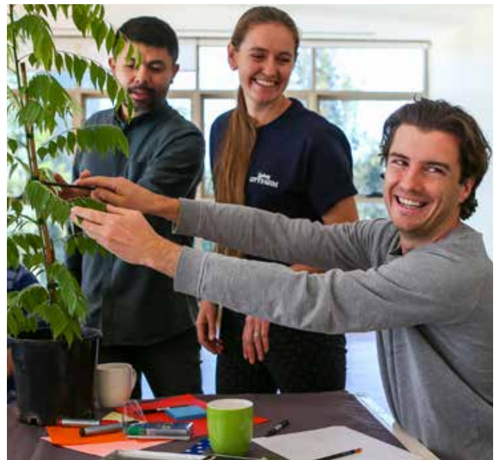
Group participating in a workshop at Sydney City Farm, an urban agriculture project in Sydney Park

We know that international students take many factors into account when deciding where to study. We can't influence all these factors but, by working with strategic partners, we can help ensure that Sydney remains Australia's premier education destination, and a global leader.