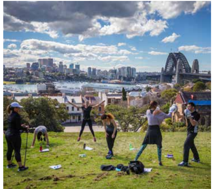
Outdoor fitness class with a view at Observatory Hill

We recognise that students may struggle to find affordable housing. Where appropriate, we will promote and facilitate the development of affordable student housing.