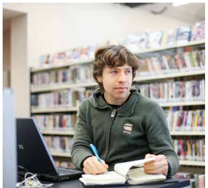
Our libraries offer study space and free wifi

The quality of the international education sector enhances Sydney's position globally as a leading education and research destination. The sector also delivers direct and indirect benefits to local economies, creating jobs and contributing to the community. International students increase cultural diversity, enhance the vibrancy of the city and promote its reputation internationally. Today's student is tomorrow's ambassador abroad.