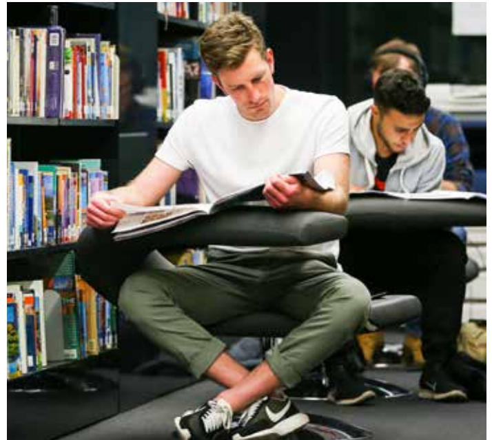
Our libraries offer a quiet place to study

We will examine quantitative and qualitative indicators to track the success of the actions in this plan. Our indicators will not be absolute measures of performance, but rather signal trends in the sector. We may be able to compare the results we generate with Australian and NSW statistics on the education sector. However, we will not be able to tell whether the local sector is outperforming or underperforming against state or national trends.