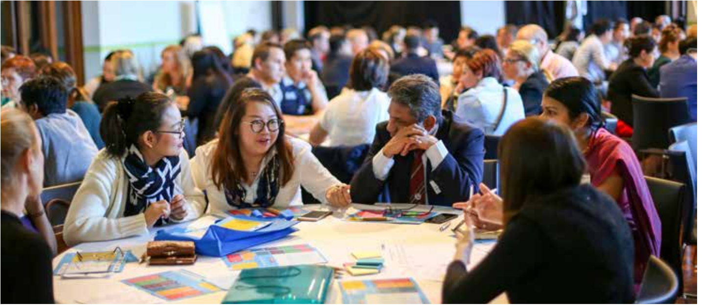
Group discussion at the Education Provider Forum on international student wellbeing